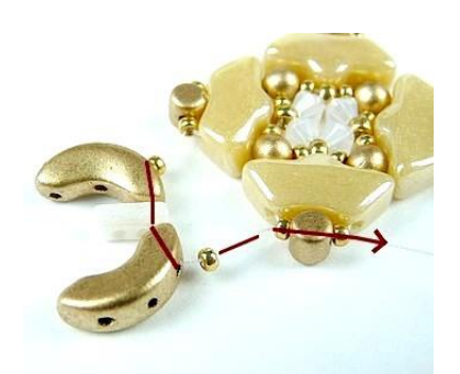
9) Pick up 1 R15, 1 Arcos, 1 Piros, 1 Arcos, 1 R15