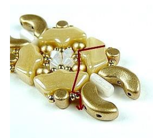
12) Pass through beads like picture