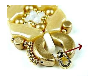
14) Place 1 ring between the Arcos