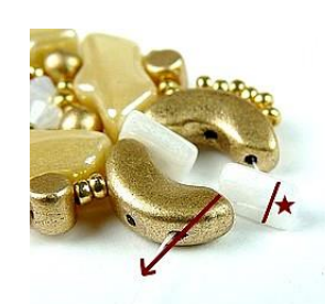
21) Pick up 1 Piros in the top hole