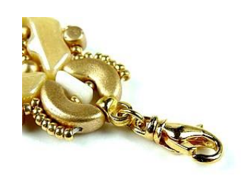
33) Place your clasp with a ring ©

Happy beading! Thank you for respecting my work ©