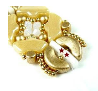
25) You'll now have this © Repeat to strengthen