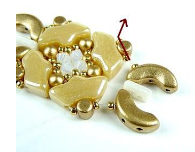
11) Repeat step 9