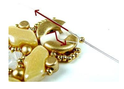
23) Exit through the top hole of Piros, pick up 1 R15 and exit through the bottom hole of Piros