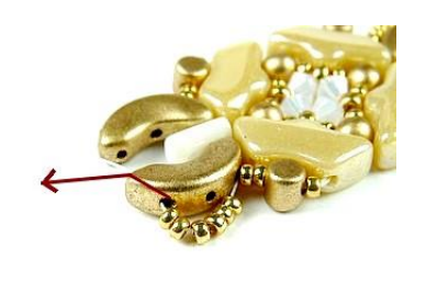
20) Pick up 6 R15