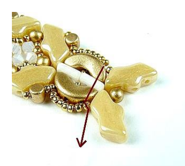
28) Exit like picture