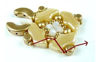
10) Pass through beads like picture