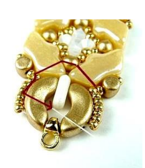
16) Pass through beads like picture and exit through the central hole of Arcos