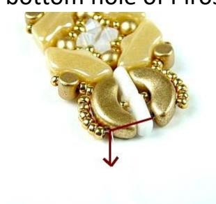
26) Exit like picture