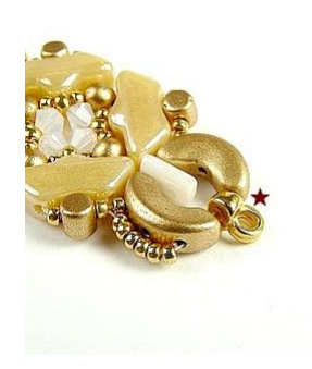
32) Close your work like steps 13 to 18 and tie off