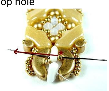
24) Pick up 1 R15, pass through the top Piros