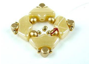
5) Pick up 1 R15, 1 R11, 1 R15 between the PR3, repeat for the 4 Delos