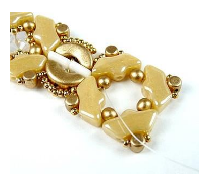
31) Repeat steps until you have made 6 elements, for a bracelet of 18 cm