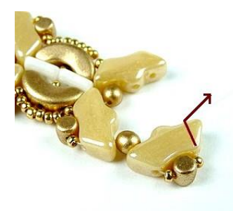
30) Repeat until you have used a total of 4 Delos © like step 4