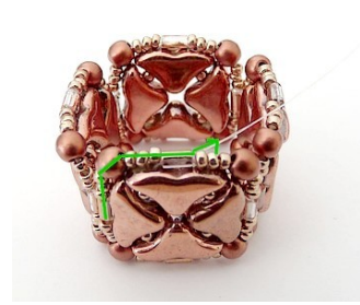
18) You'll now have this ☺. Exit through B3 like picture