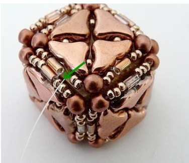
22) You'll now have this ☺