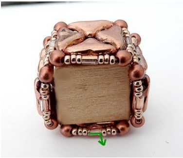
19) Place the wooden cube