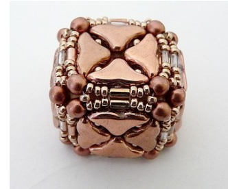
30) You'll now have this 😊