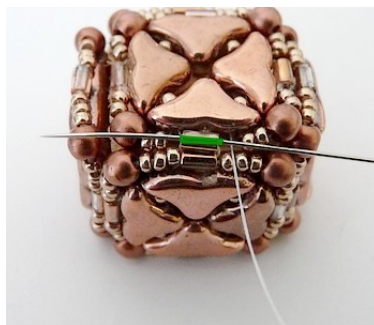
23) Exit like picture