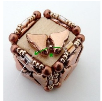
21) Pick up 1 Helios, 1 R15, 1 Helios and repeat steps 3 to 5