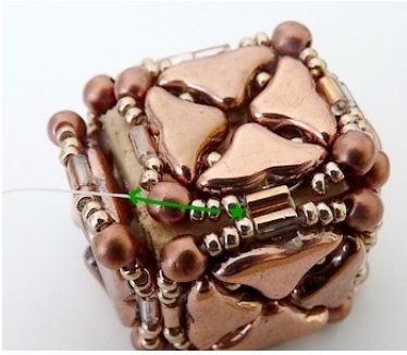
25) Pick up 1 R15 and exit through PR3 like picture