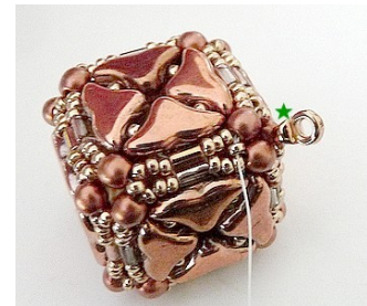
33) Place your cymbal or ring of your choice, repeat to strenghten. Close your work 😊