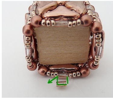
20) Pick up 1 B3, exit through B3, repeat to strengthen