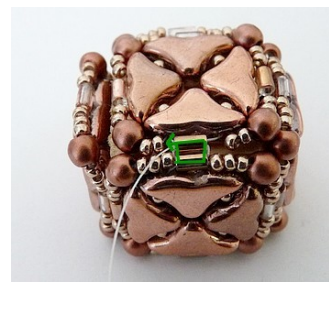
24) Zip the 2 B3, exit like picture