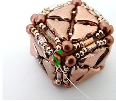
26) Pick up 1 R15 and exit through PR3 like picture