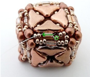
28) Pick up 1 R15, exit through B3