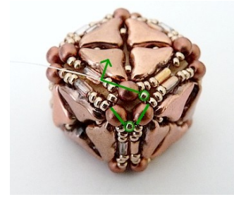
27) Repeat step 26 2 more times and exit like picture, through the 2 R15