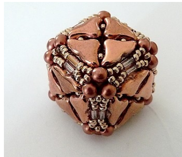
32) You'll now have this 😊