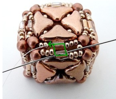
29) Zip the 2 B3 and repeat steps 25 to 28