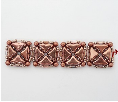
16) Bead a total of 4 elements ☺ Exit through B3 like picture