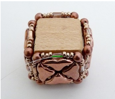
31) Turn work over and repeat steps 20 to 28