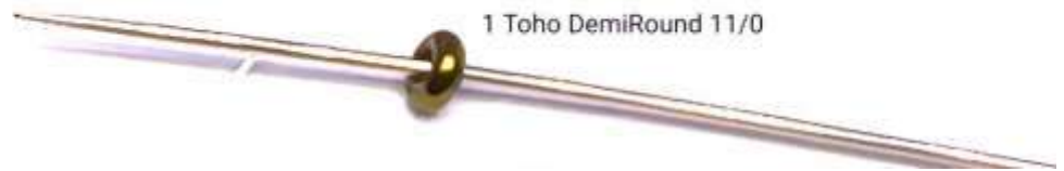
1 Toho DemiRound 11/0