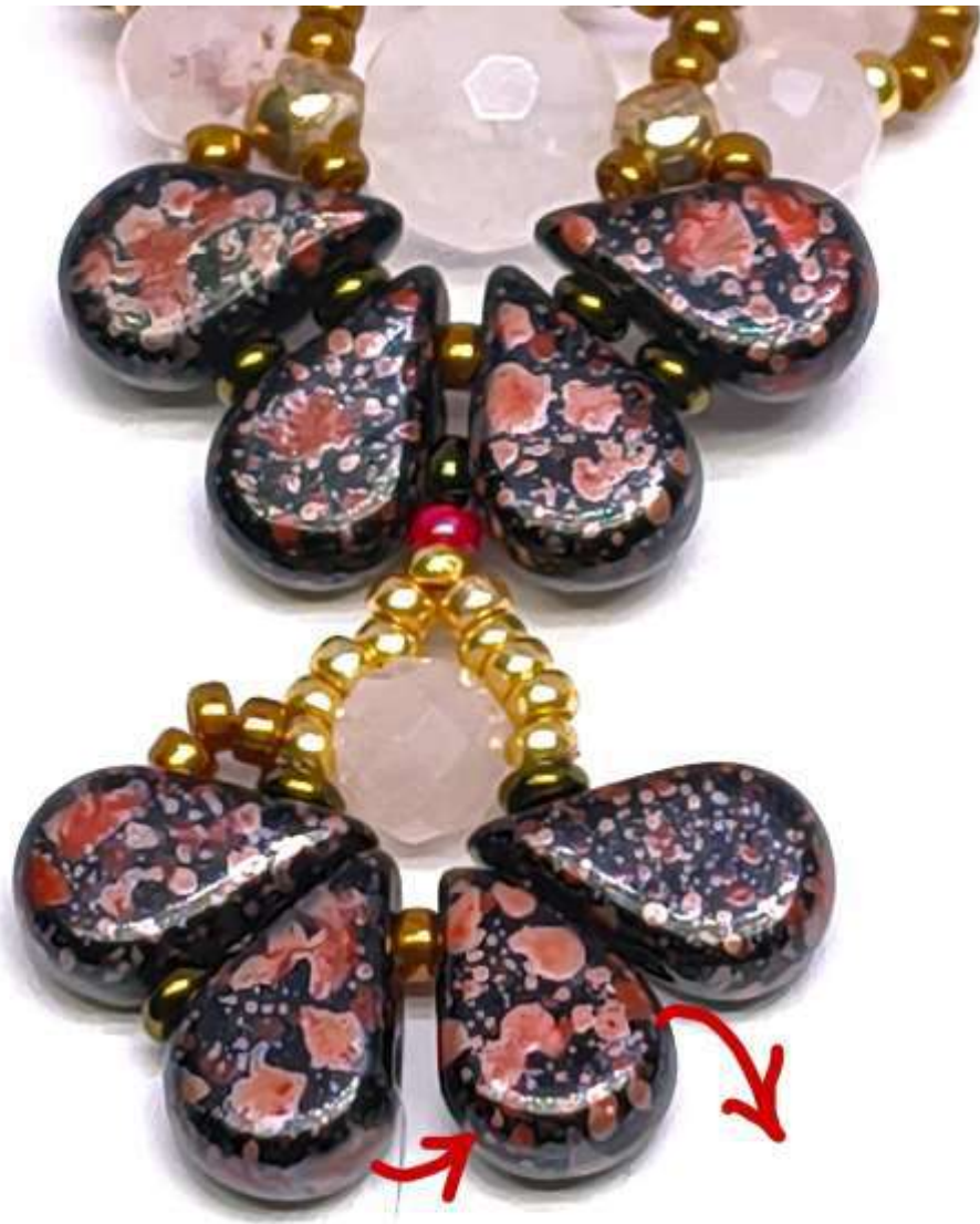
1 Toho DemiRound 11/0