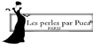
Diagram BO « Nora » © par PUCA®