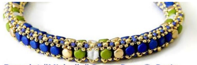
Bracelet "Michelle"© par Puca®-Paris