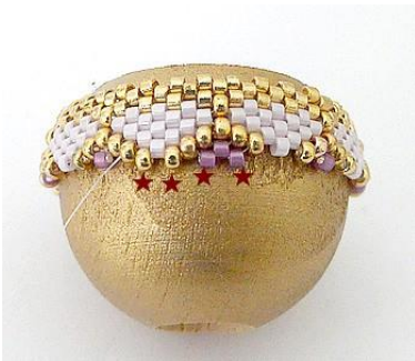
10) Pick up 2 DB Pink, 2 SB11. DERLT