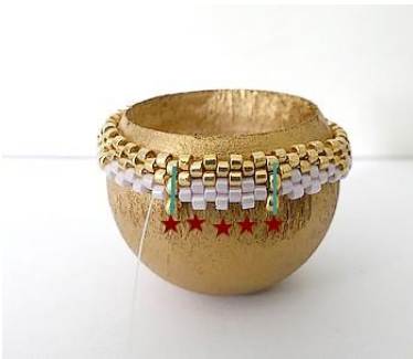
7) Pick up 1 SB11 Gold (bellow the SB11 Gold), 3 DB White. DERLT