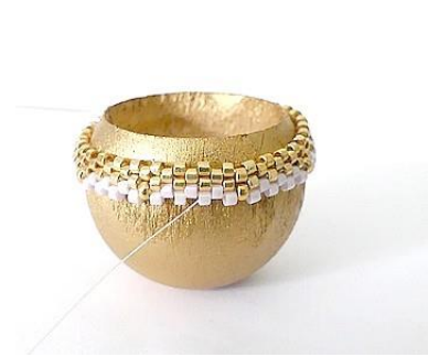
6) Make 1 row of DB White