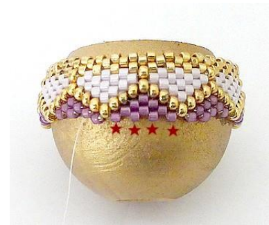
12) Make 1 row of DB Pink