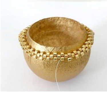
4) Place your work on the Sam support