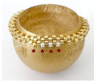
5) Pick up 3 DB White, 1 SB11 Gold. DERLT