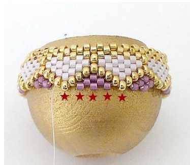
11) Pick up 1 R11, 3 DB Pink, 1 SB11. DERLT