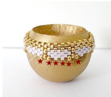
8) Pick up 1 SB11 Gold on each side of the SB11 Gold, 2 DB White. DERLT