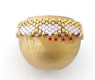
9) Pick up 1 SB11, 1 DB Pink, 1 SB11, 1 DB White. DERLT