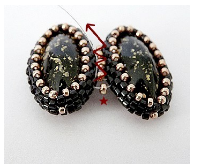
7) Pick up 1 R11 and pass through all beads again