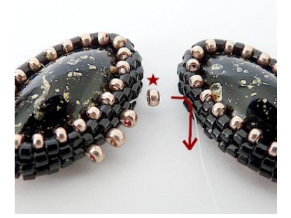
4) Pick up 1 R11 and zip to the 2nd set