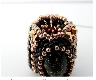
14) You will now have this Exit through the 3 R15 like picture