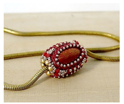
23) For this version, bead steps 2 to 18 (3)

Happy beading! Thank you for respecting my work © ③