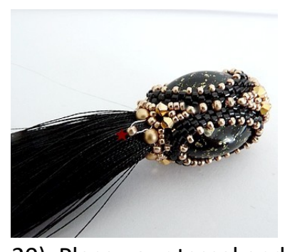
20) Place your tassel and eye pin into the bead. Repeat step 17, then a R11 row between the PR4. Tigthen and close your work