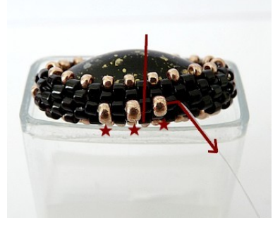
3) Pick up 3 R11