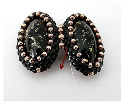
6) You will now have this