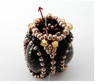
16) You will now have this (3) Exit like picture