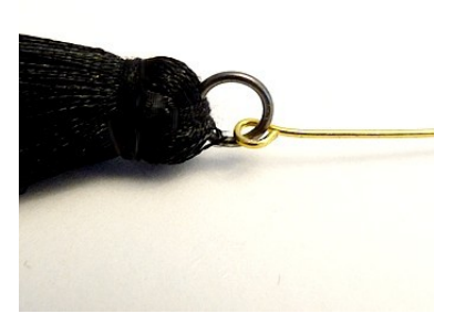
19) Place a ring and an eye pin on your tassel