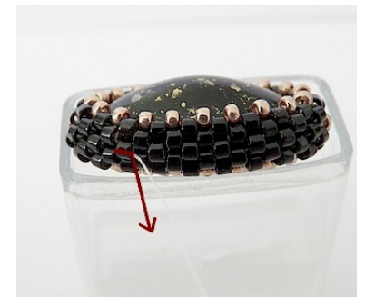
2) Exit like picture, 3rd DB row to 8th DB of the set R15