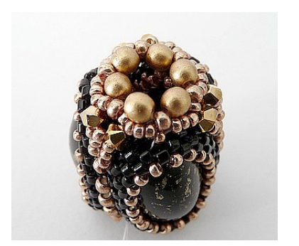
18) You will now have this Repeat steps 10 to 18 for the other side