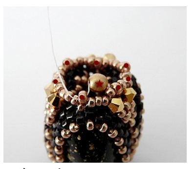
17) Pick up 1 PR4 between each R11 and tighten