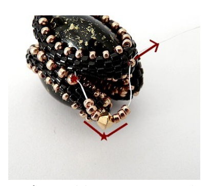
10) Exit like picture and pick up 3 R 15, 1 T3, 3 R 15 into the R15 of the set, repeat for the length of the pattern