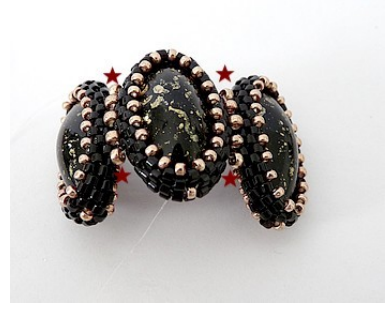
8) Repeat steps 2 to 7 to place the 3rd Athos