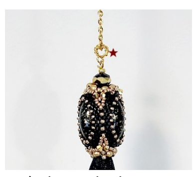
22) Place a bailor a ring