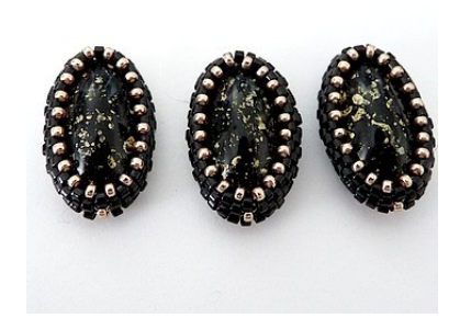
1) Set your 3 Athos (check special pattern «Component Athos»)