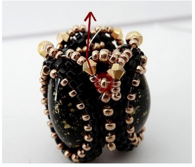
13) Pick up 1 R15 into the T3, tighten, repeat steps 12 and 13 for the length of the pattern