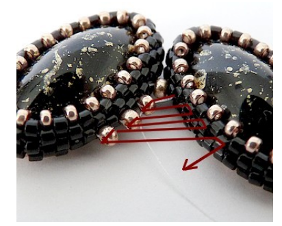
5) Zip all R11 with DB face to face