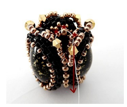
12) Pick up 1 R15, 1 R11, 1R15 into the T3