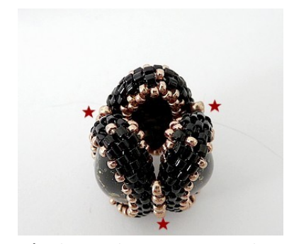
9) Then close your 3rd Athos