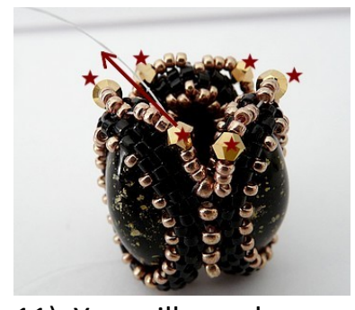
11) You will now have this Exit through T3