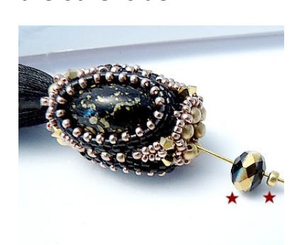
21) Pick up 1 bead of 8mm and 1 R8, make a loop