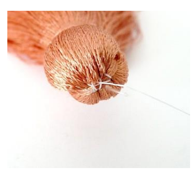
38) Consolidate like picture