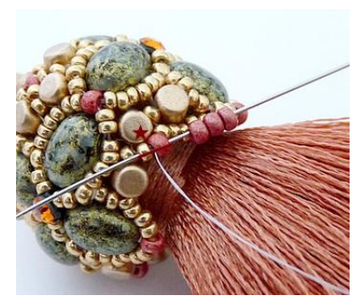
47) Pick up 3 R11 in loom, pass through the 1st R11