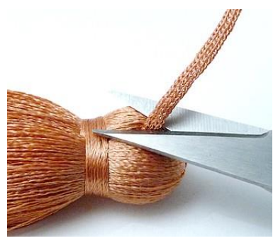
36) Let's use our tassel! Cut the rope