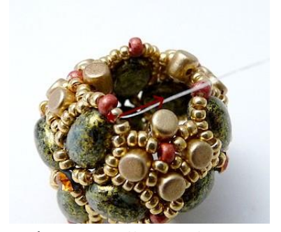
30) You will now have this © Go out like picture, through the R15