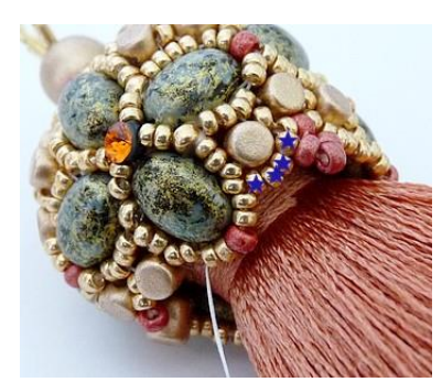
48) Pick up 4 R15, go out like picture, repeat for the length of the pattern ©