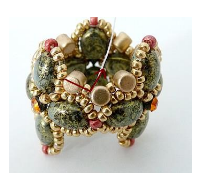
21) Go out like picture, pass through the R15 between Minos