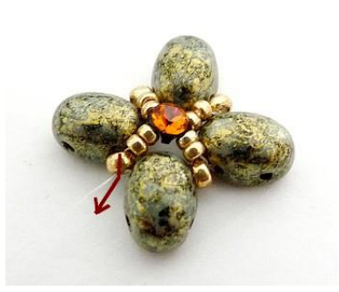
4) Pick up 2 R15 and go out like picture, pass through the R11