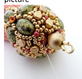
41) Place your tassel