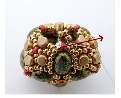
33) Pick up 3 R15 making a loop, repeat for the length of the pattern