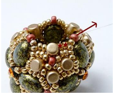
32) Pick up 2 R15 and go out like picture, through the R11