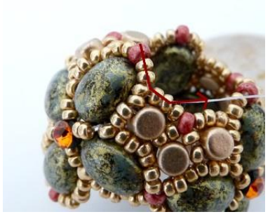
29) Go out like picture and repeat step 28