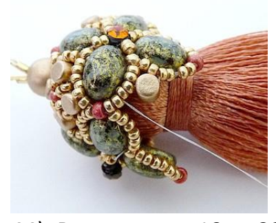
44) Repeat steps 19 to 22