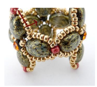
18) Go out like picture, pass through the 4th R15