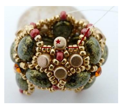
28) Pick up 1 Minos, pass through the 2 R15 and go out like picture through the R11