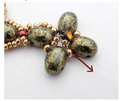
14) Repeat steps 2 to 14