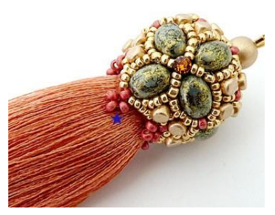
50) You will now have this \odot , you can tie off