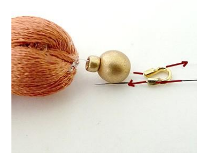
39) Pick up 1 R 8, 1 PR6 and 1 U