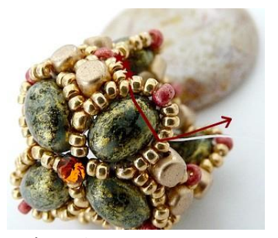
26) Pick up 3 R15, pass through the 3rd R15 and through the Samos, go out like picture, repeat for the length of the pattern