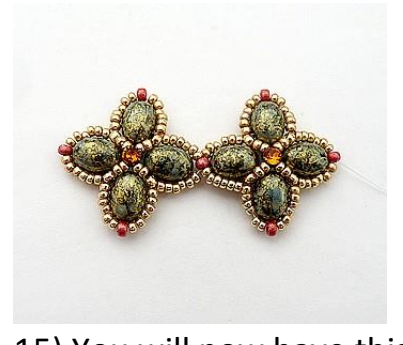
15) You will now have this