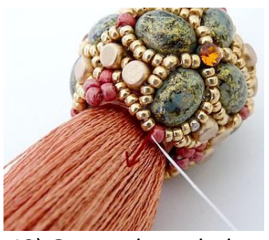
49) Go out through the R11 below the Samos and pick up in loom 3 R11, repeat for the 3 Samos