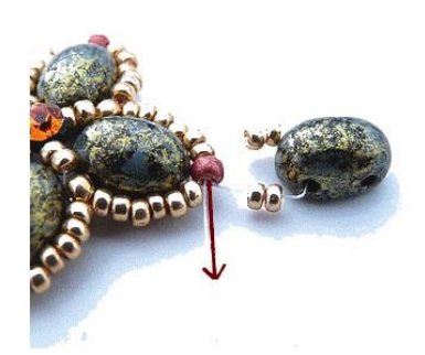
10) Pick up 2 R15, 1 Samos, 2 R15, pass through the R11