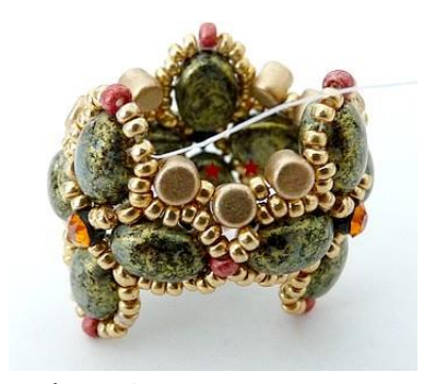
20) Pick up 1 R15 between Minos, repeat for the length of the pattern