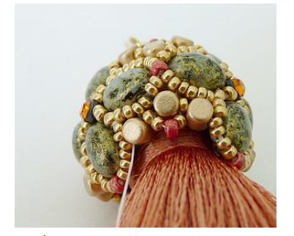
45) You will now have this