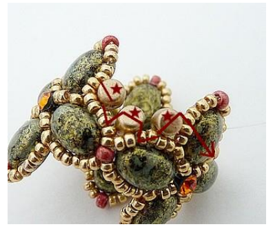
19) Pick up 3 Minos every 2 R15, repeat for the length of the pattern