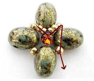
2) Pick up 2 R15, 1 SM (top hole), 2 R15, pass through the R11 and go out like picture