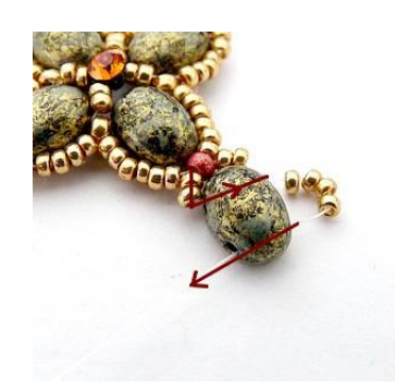
11) Go out like picture, pick up 4 R15, pass through Samos (bottom hole)