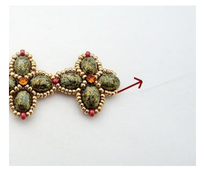
16) Repeat until you have made a third flower, without step 8