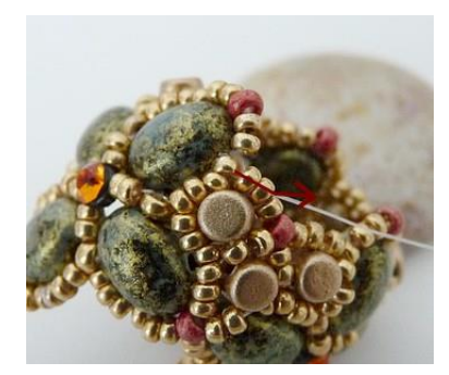
27) Go out like picture, through the central R15