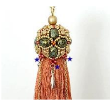
52) Another idea, you can 53) Put a chain, ring and put some chains!