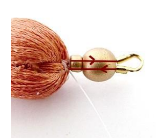
40) Pass through all the beads several times to tighten