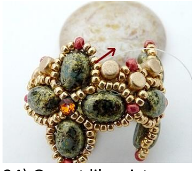
24) Go out like picture, pass through the 3rd R15