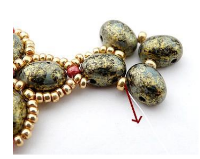
13) You will now have this Go out like picture