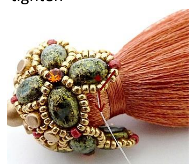
43) Exit like picture, at the bottom of tassel