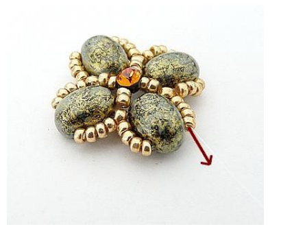
7) You will now have this © Go out like picture