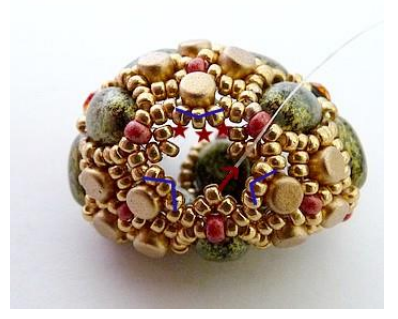
35) Pick up 3 R 15 above each Minos and exit through the central R15 above the R11