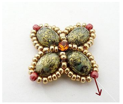
9) You will now have this Go out like picture