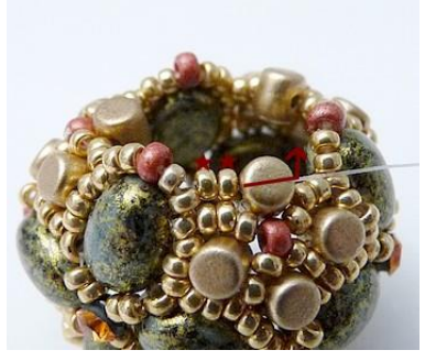
31) Pick up 2 R15 through the Minos