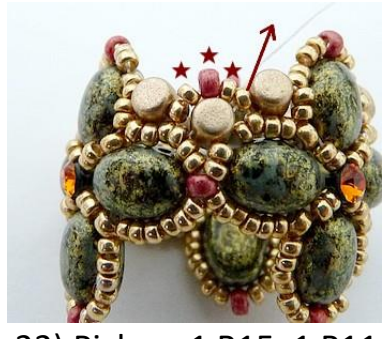
22) Pick up 1 R15, 1 R11, 1 R15 between the R15