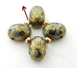
1) Pick up 4 Samos and 4 R11 alternately and close, go out like picture