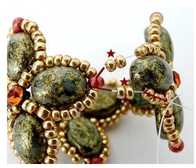
17) Zip with 2 R15, pass through the R11, pick up 2 R15, pass through the Samos of the first flower