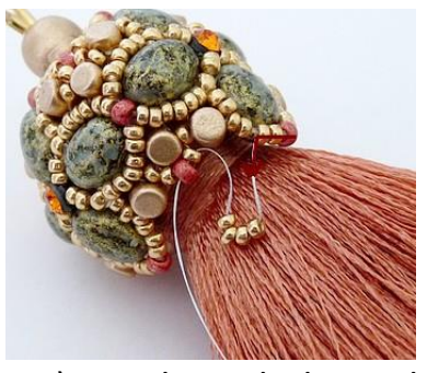
46) Exit through the 2nd R15 below Samos and pick up 4 R15 through R15 and R11