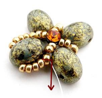
6) Pick up 4 R15, pass through the R11. Repeat the step for the 4 Samos