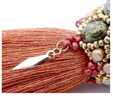
51) Place the charms through the central R11