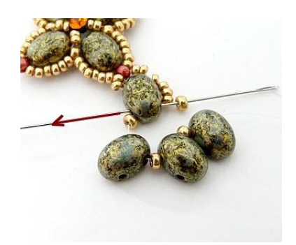
12) Pick up 4 R11, 3 Samos alternately, pass through Samos