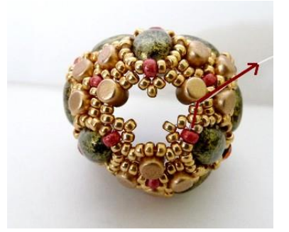
34) You will now have this , go out through 2 R15 like picture