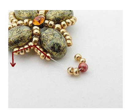
8) Pick up 2 R15, 1R11, 2 R15 and go out like picture, repeat this step for the 4 Samos