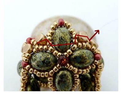
23) Go out like picture, repeat step 22-23 for the length of the pattern